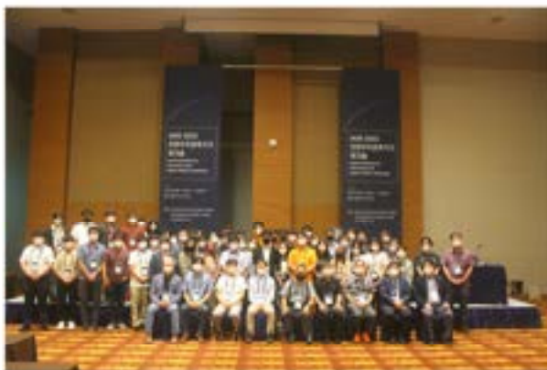
2022 천문우주관측기기 워크숍 기념촬영

2023년에도 한국천문학회 천문관측기기분과가 주도하는 천문우주관측기기 워크숍에 공동 주관을 맡아 진행합니다. 아울러 우리 분과는 SPIE(The International Society for Optics and Photonics) 국제 컨퍼런스의 국내 유치를 준비하고 있습니다.