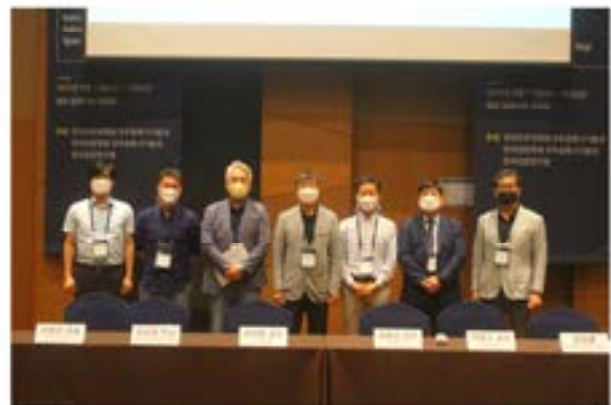
2022 천문우주관측기기 워크숍 패널 토론회 기념촬영